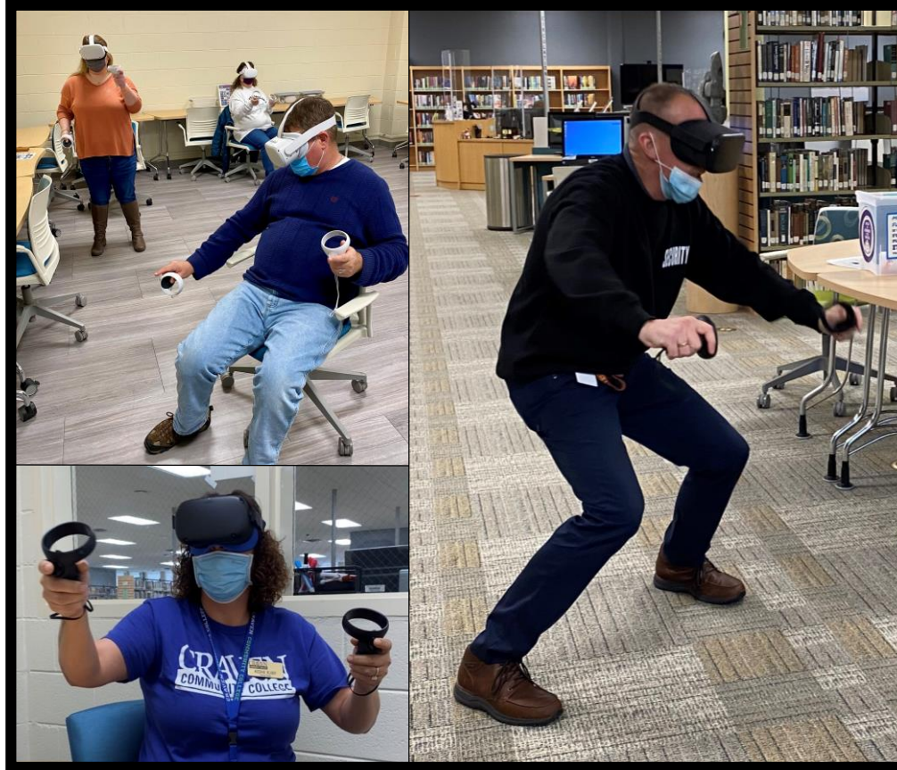
Faculty & Staff