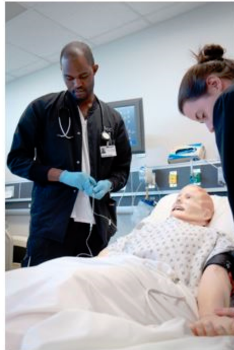
Associate Degree Nursing Students, 2018

The collaborative efforts between the Society of North Carolina Archivists (SNCA) and the North Carolina Community College Archives Association (NCCCAA) provide free educational opportunities to archivists and librarians.