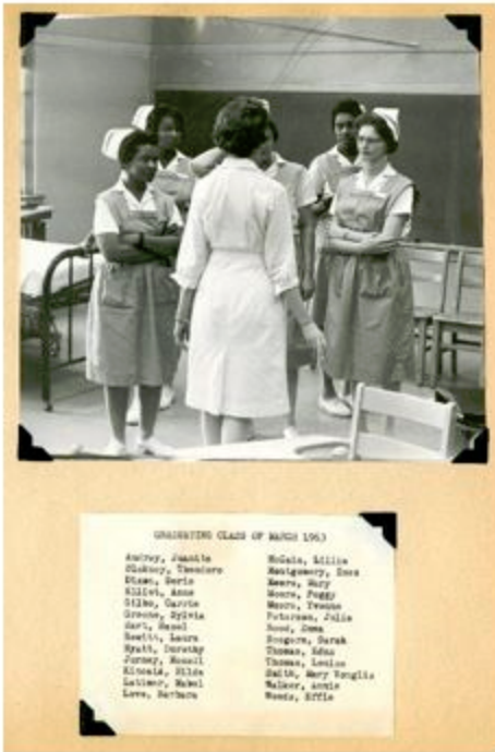
Students in the Practical Nursing Program of Central Piedmont Community College, 1963.