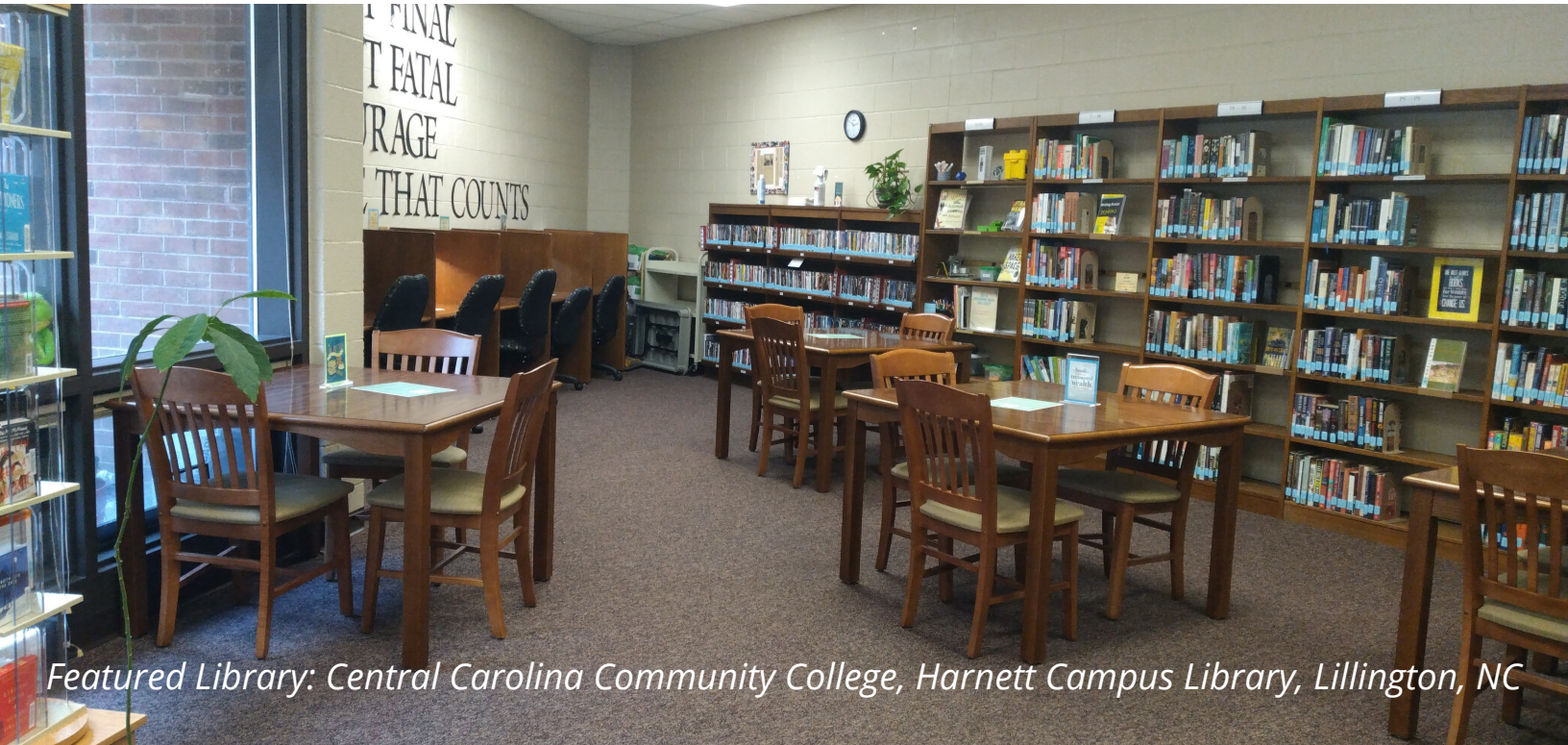
Featured Library: Central Carolina Community College, Harnett Campus Library, Lillington, NC

A monthly publication of the North Carolina Community College Library Association