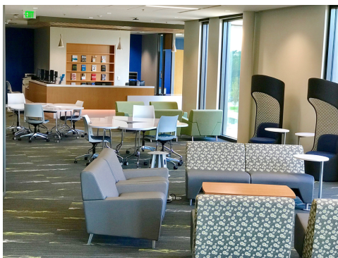
RTP Library Learning Commons

Two librarians provide instruction and research assistance to students, staff, and faculty. They also provide tours to the many campus visitors. So next time you're flying in or out of RDU, swing on by and say hi.