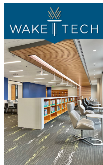
RTP Library Reading Room