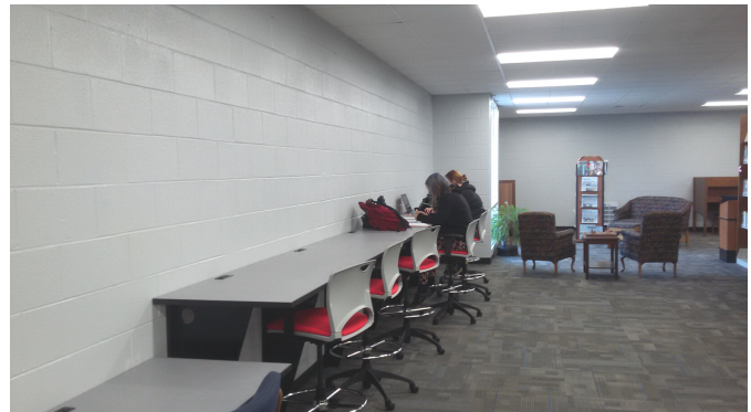
Images - Top: study room; Middle: computer stations; Bottom: charging bar