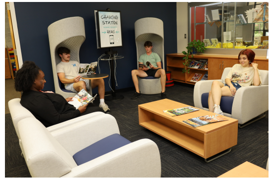
Images: Left - BCC Student Services Building A; Top right - Students in the Library; Bottom right - Students in Tube Chairs