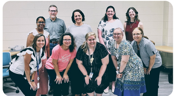
District 2 at Craven CC - June 2022

View the recording at https://youtu.be/Qq0ELcEuzog